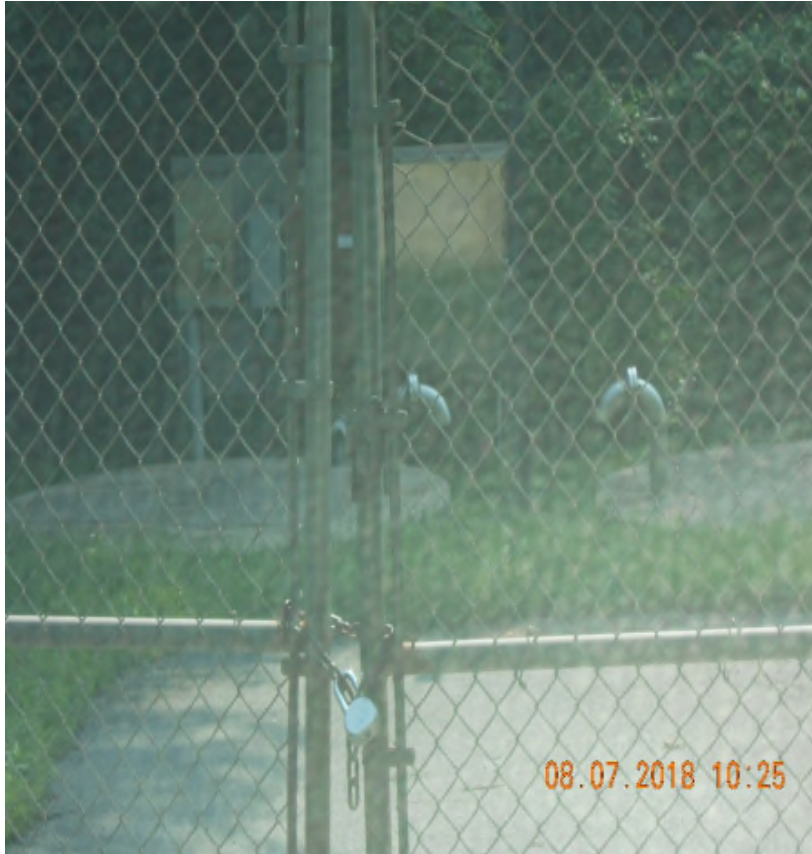
Buddies Place Pump Station