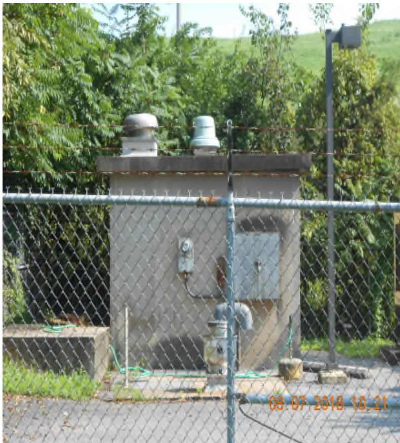
Pottstown Pump Station