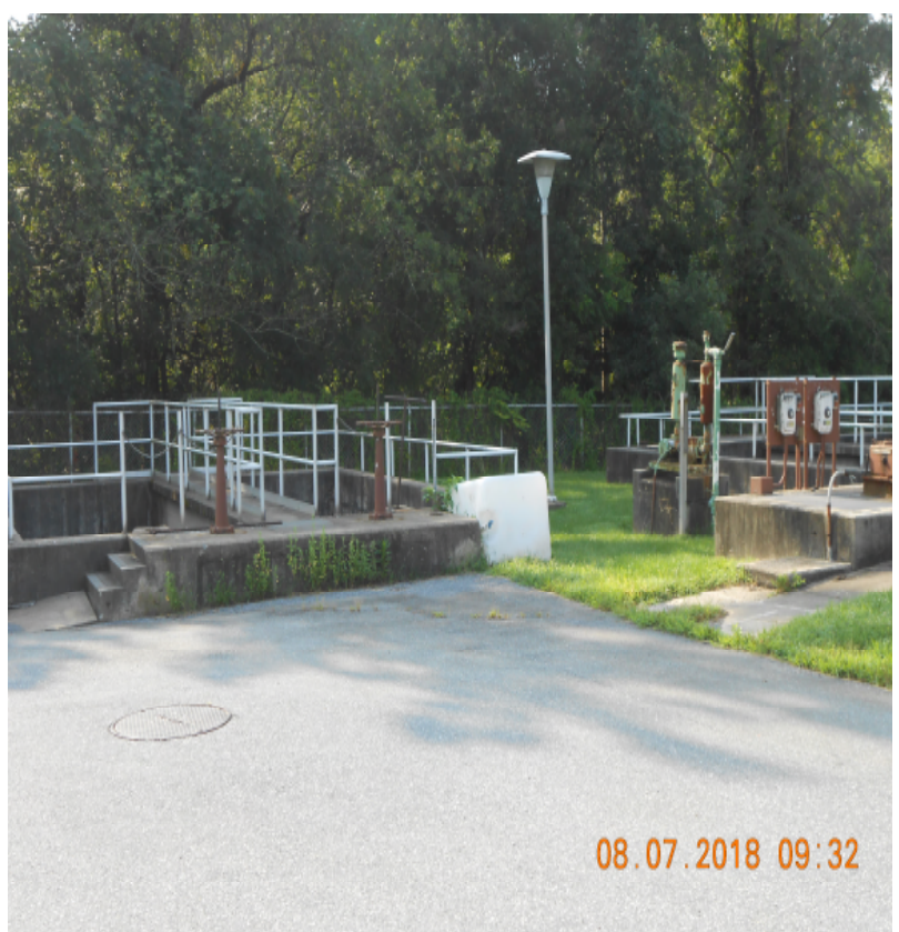
Original Contact Tanks (not used)