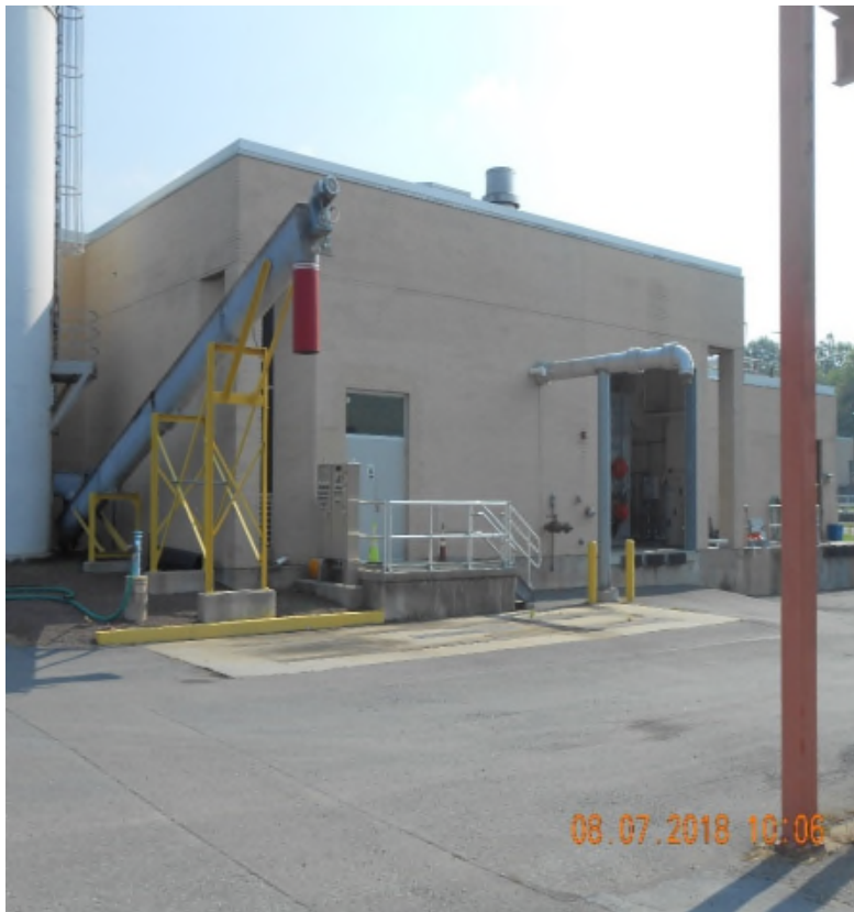
Sludge Drying Building