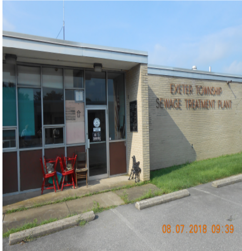
Original Construction – Control & Blower Bldg.