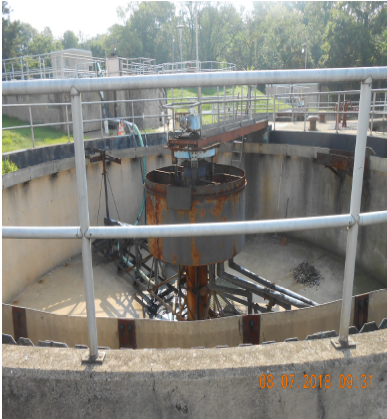
Original Clarifier (not used)