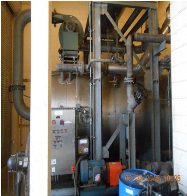
Sludge Drying Equipment