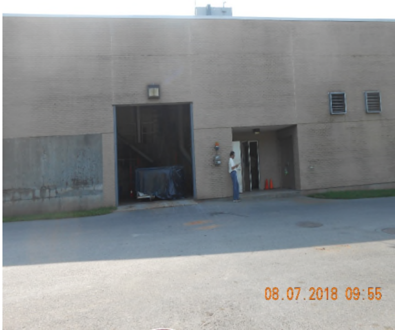
Sludge Dryer / Blower Bldg.