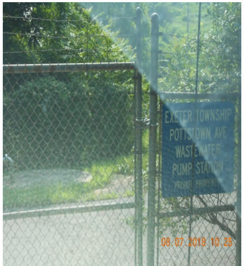
Pottstown Pump Station