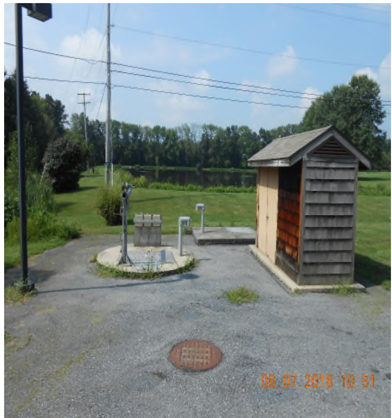
Glen Oley Farms Pump Station