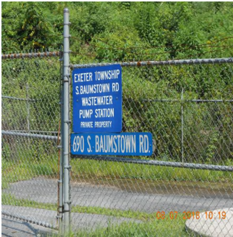
Baumstown Pump Station