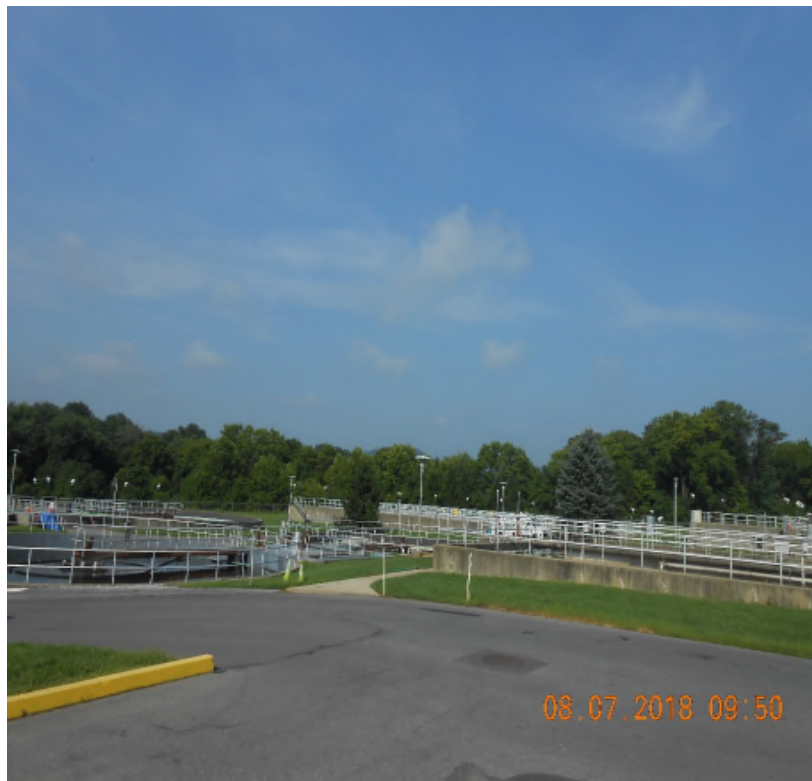
Overview Clarifiers & Diversion Box