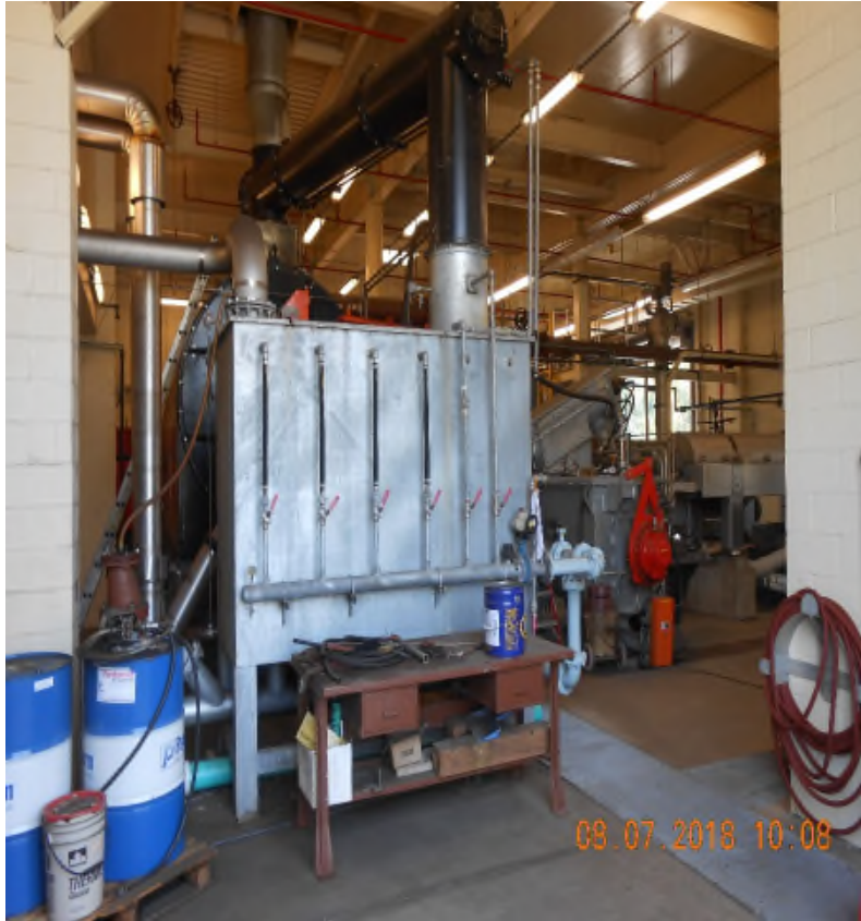
Sludge Drying Equipment