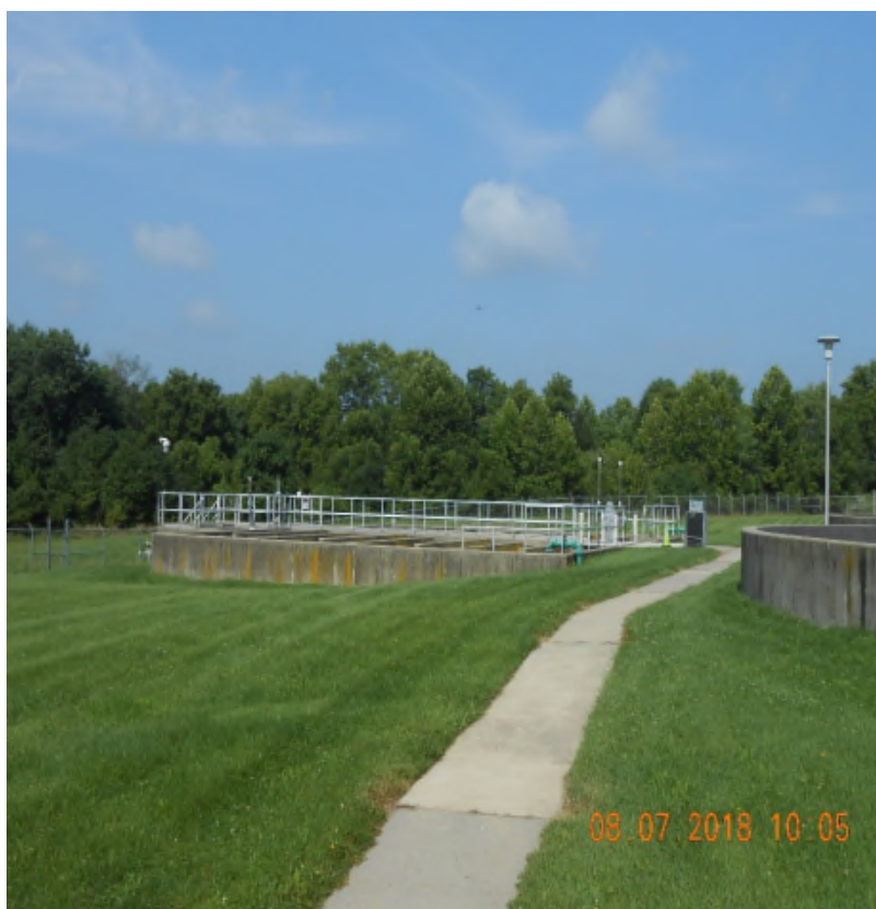
Chlorine Contact Tank