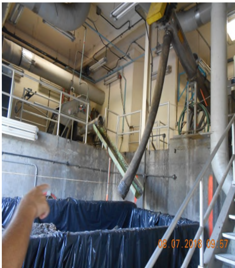
Sludge Dryer Equipment