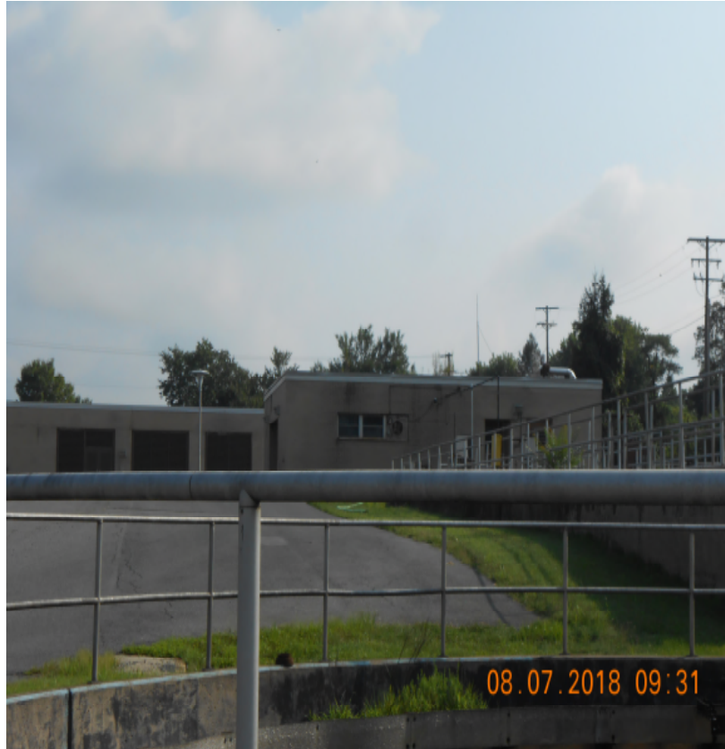
Original Control & Blower Bldg. (not used)