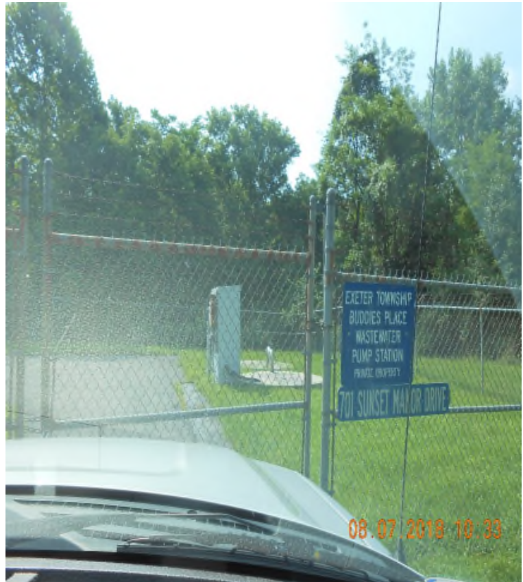
Buddies Place Pump Station