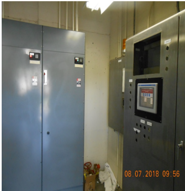
Blower Control Panel