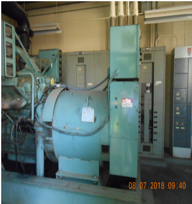
Back-up Diesel Generator