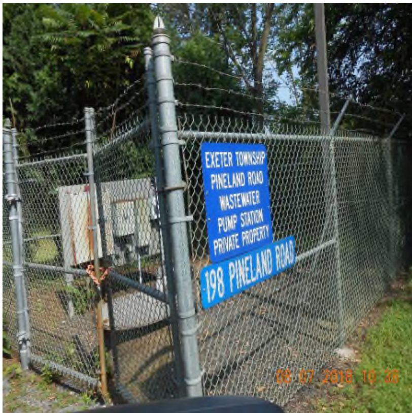
Pineland Pump Station