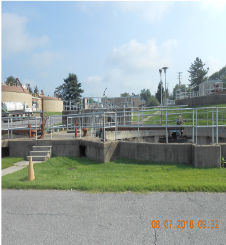
Original Clarifier (not used)