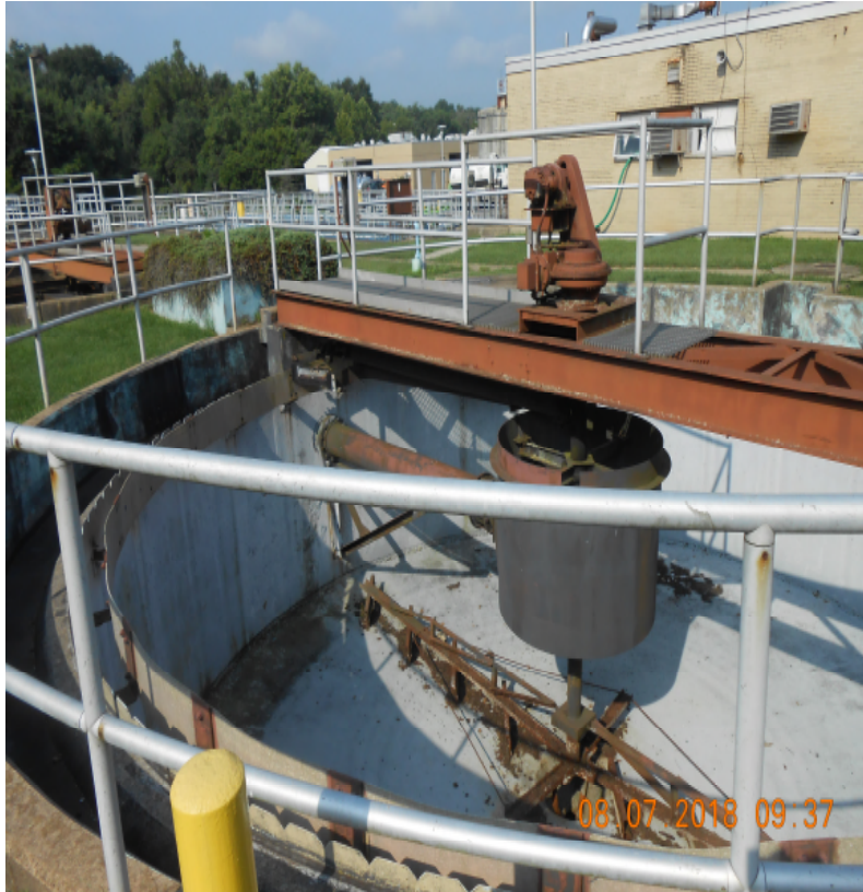
Original Construction – Clarifier (not used) Total of 4