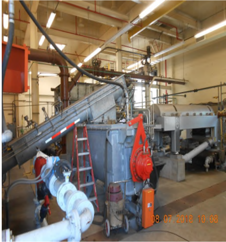
Sludge Drying Equipment