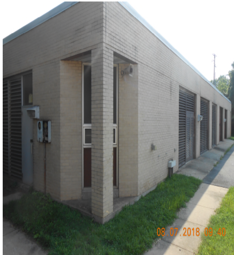
Back-up Power Bldg.