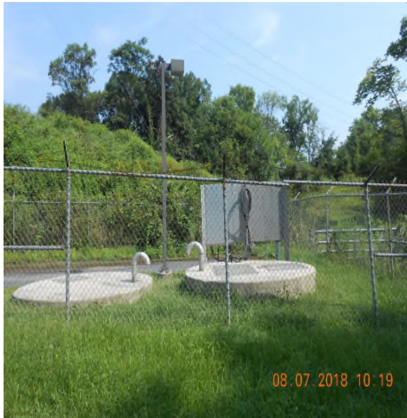
Baumstown Pump Station