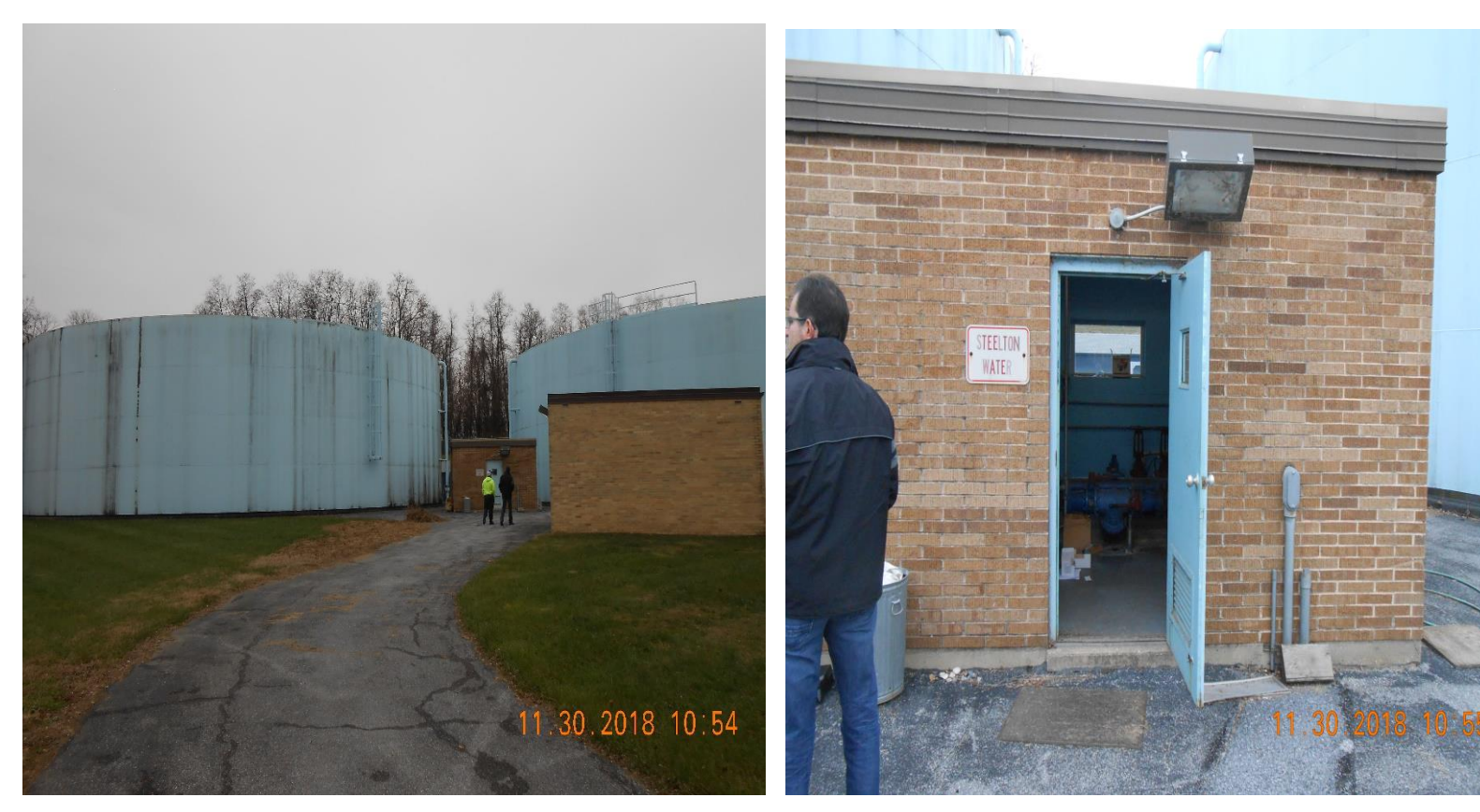
2 Million Gallon Tanks