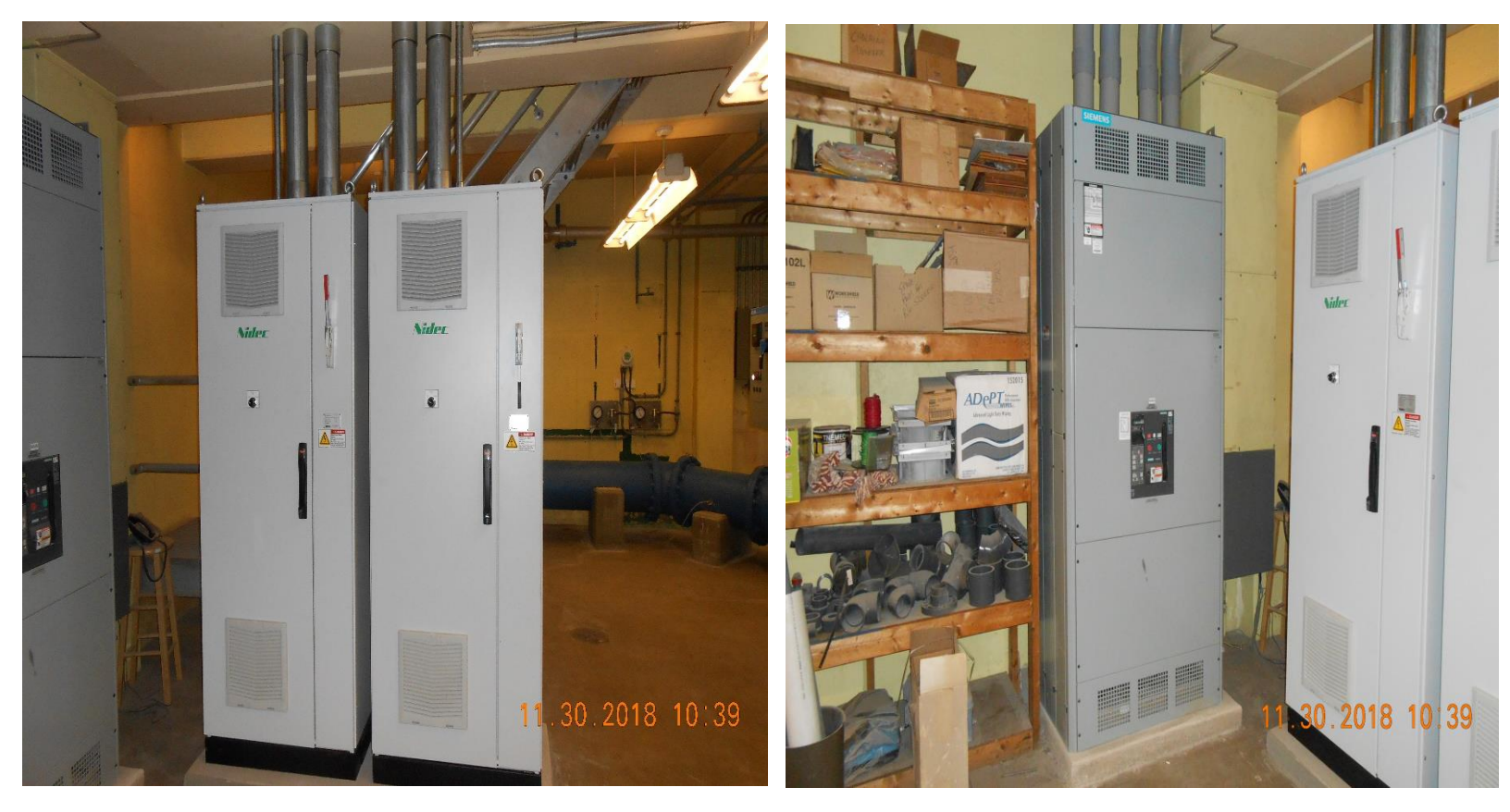
Piping Gallery & Booster Pumps Steelton Plant Inspection Pictures