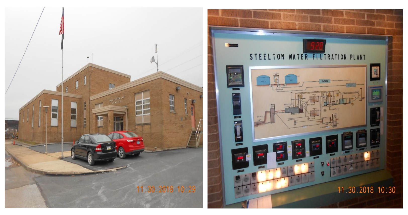
Filter Biulding (1973)