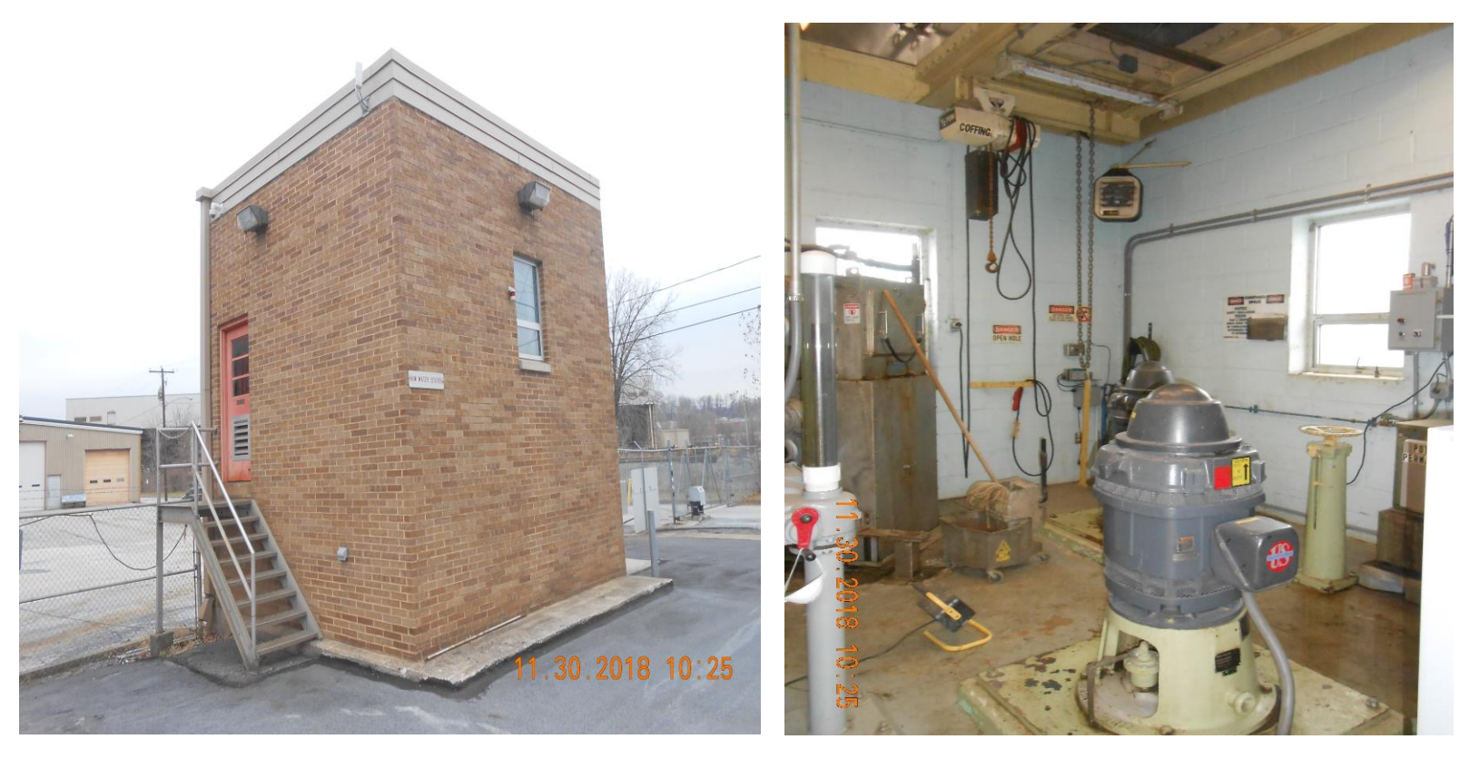
Raw Water Station (1973)