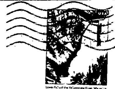
Lower Falls of the Yellowstone River, Wyoming

Public Utility Commission Commonwealth Keystone Building 400 North Street Harrisburg, PA 17120