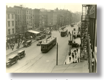
Streetcars on Market Street in Philadelphia, September 1920.

corporations. Upon its creation, the Railroad Commission immediately set about investigating and arbitrating complaints and railroad accidents, proposing new statutes, working to establish a list of common carriers operating in the Commonwealth and generally organizing the Commission itself. States, including Pennsylvania, quickly moved to broaden the scope and authority of these early regulatory commissions.