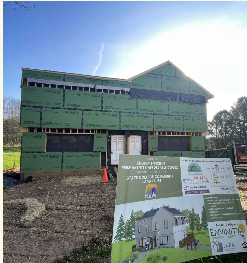
Duplex Retrofit – Passive House