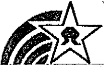
EXHIBIT 4.2 pg. 1/2