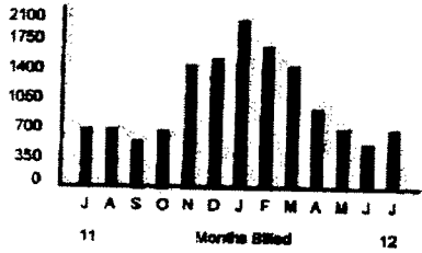
13-Month Usage (Total kWh)