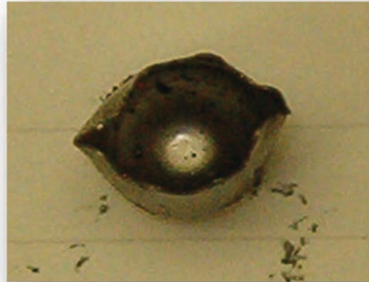
(b) Errant Strand – Partial Insertion Error

A second type of insertion error occurs from time to time, when upon inserting the conductor, the lineman pulls it back a bit (possibly to get a better grip because it was obvious that the conductor did not go in far enough – such as the condition in the previous photo – BUT when that occurs, the pilot cup does not come back , as it is held in the jaws. The purpose of the pilot cup is to keep the ends of the strands together, and assure that they all pass completely through the jaws. In the scenario where the conductor is retracted as much as \frac{1}{2} inch, the strands can escape from the pilot cup, and one may erroneously slip through the side between the jaws. In this instance, although the conductor may be fully inserted, the errant strand between the jaws prevents them from closing completely, and because it is not within the bundle, the overall diameter is reduced and again, the conductor can slip from the grasp of the jaws.