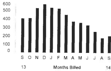
13-Month Usage (Total kWh)

Name: [REDACTED] Account Number: [REDACTED]