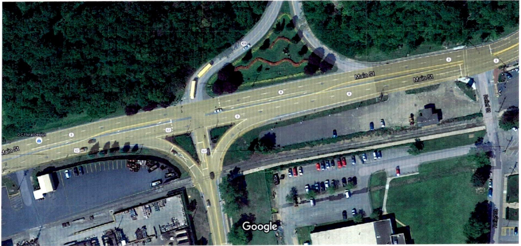
50 ft