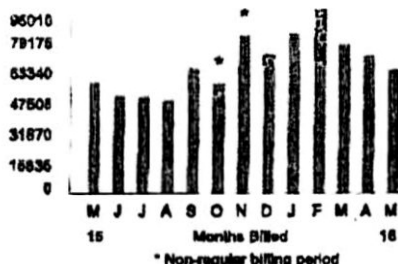
13-Month Usage (Total KWh)