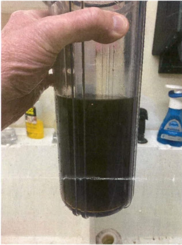
Overbrook Water Company