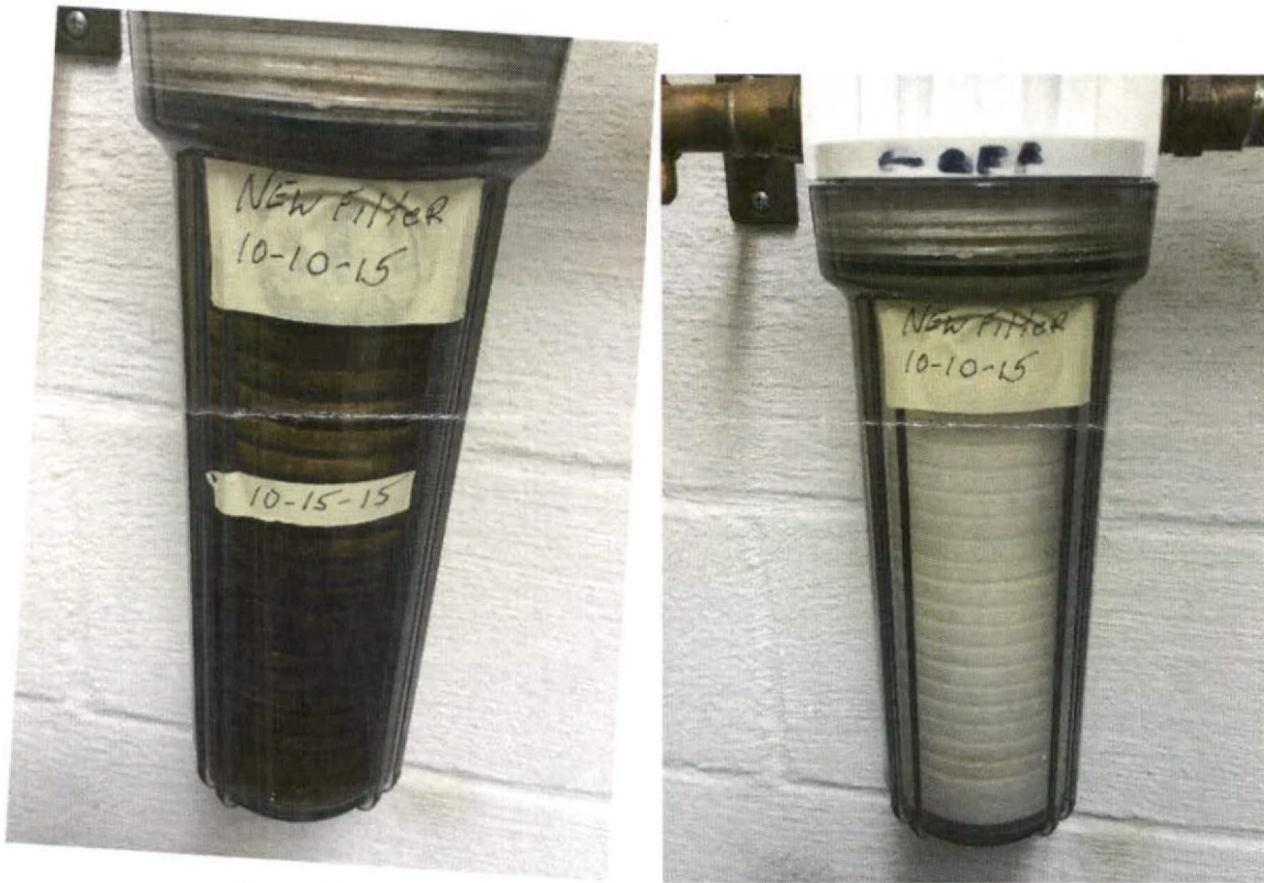
Water Filter – Same Day

This is additional information pertaining to ID #240008255 (account number).