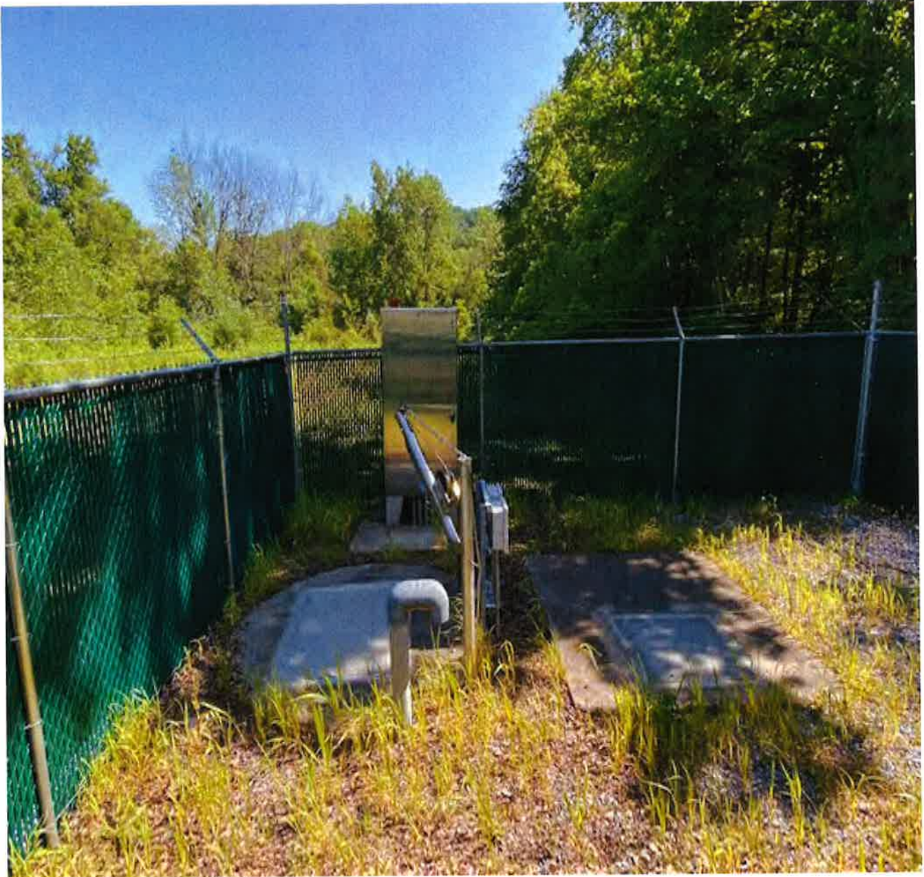
Evan Road Lift Station

PAWC – Upper Pottsgrove Township Site Visit – July 22, 2020 Engineer - Chris Pelka (LTL Consultants)