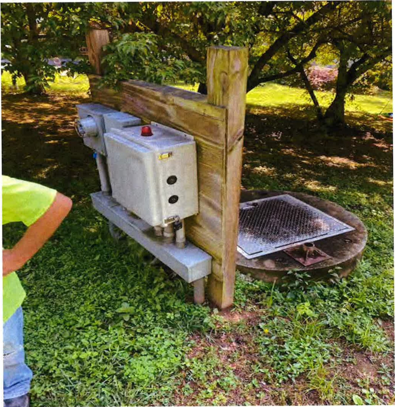
Hollyberry Court Lift Station

PAWC – Upper Pottsgrove Township Site Visit – July 22, 2020 Engineer - Chris Pelka (LTL Consultants)