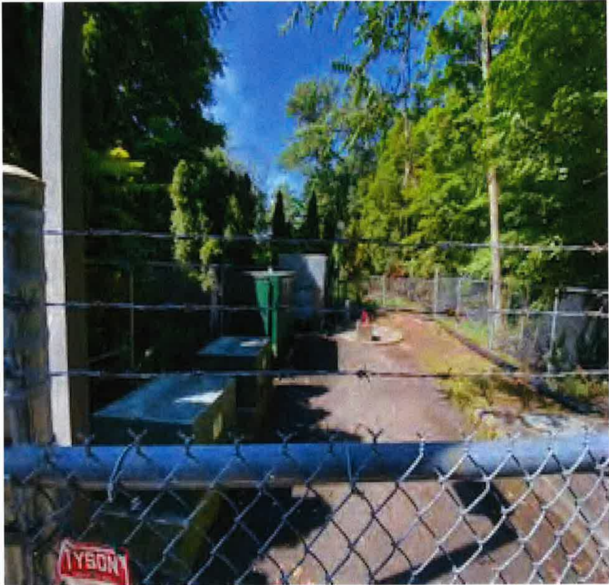
Pine Ford Road Lift Station

PAWC – Upper Pottsgrove Township Site Visit – July 22, 2020 Engineer - Chris Pelka (LTL Consultants)