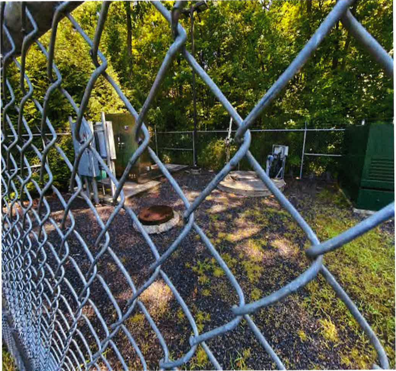
Regal Oak Lift Station

PAWC – Upper Pottsgrove Township Site Visit – July 22, 2020 Engineer - Chris Pelka (LTL Consultants)