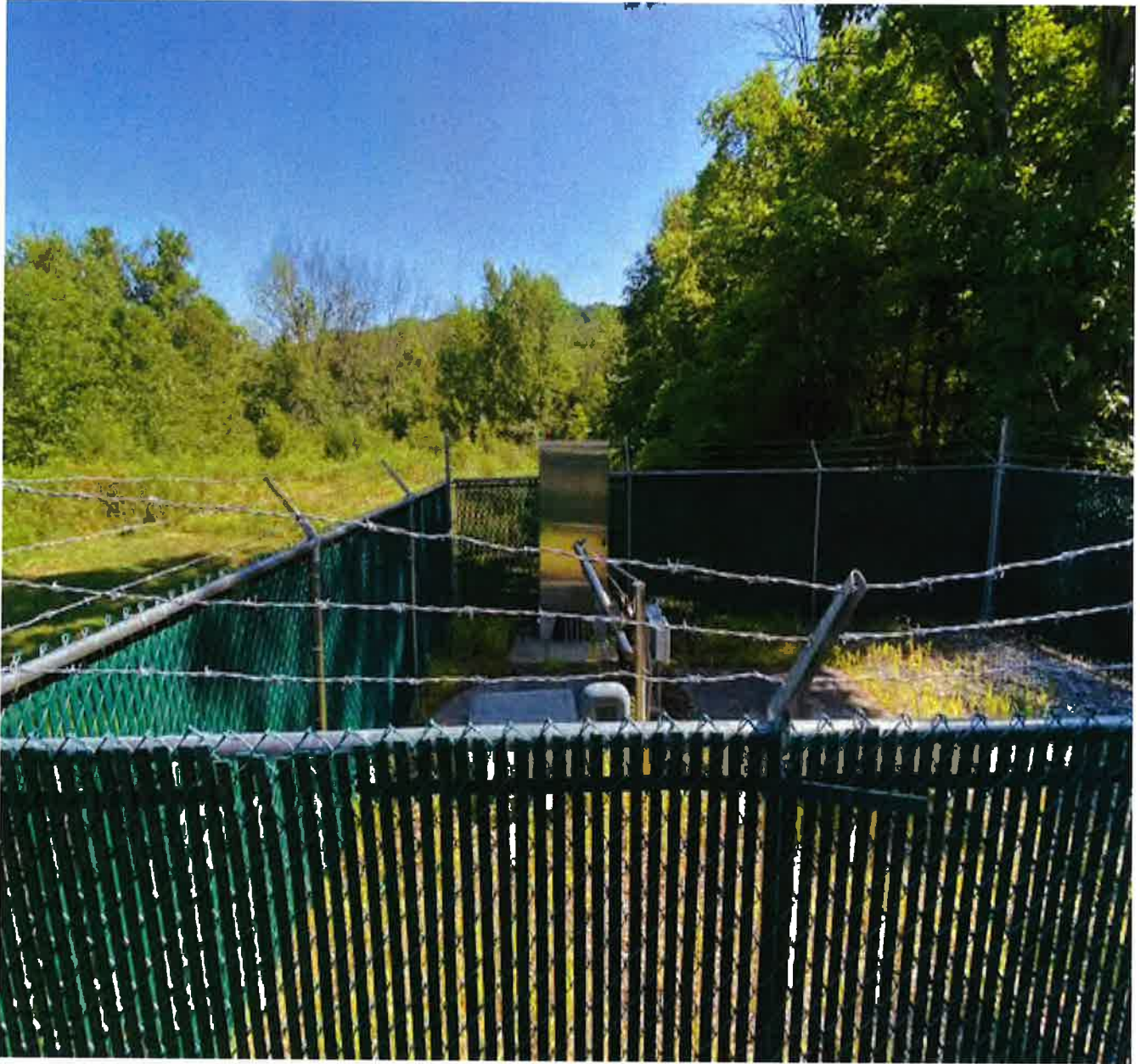
Evan Road Lift Station

PAWC – Upper Pottsgrove Township Site Visit – July 22, 2020 Engineer - Chris Pelka (LTL Consultants)