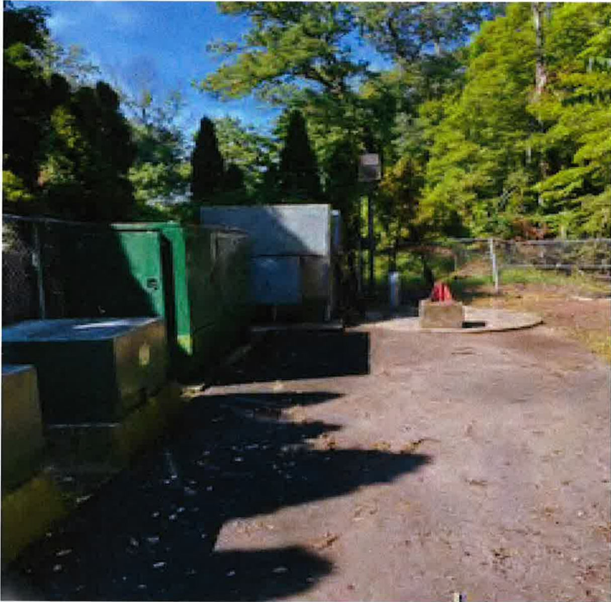
Pine Ford Road Lift Station

PAWC – Upper Pottsgrove Township Site Visit – July 22, 2020 Engineer - Chris Pelka (LTL Consultants)