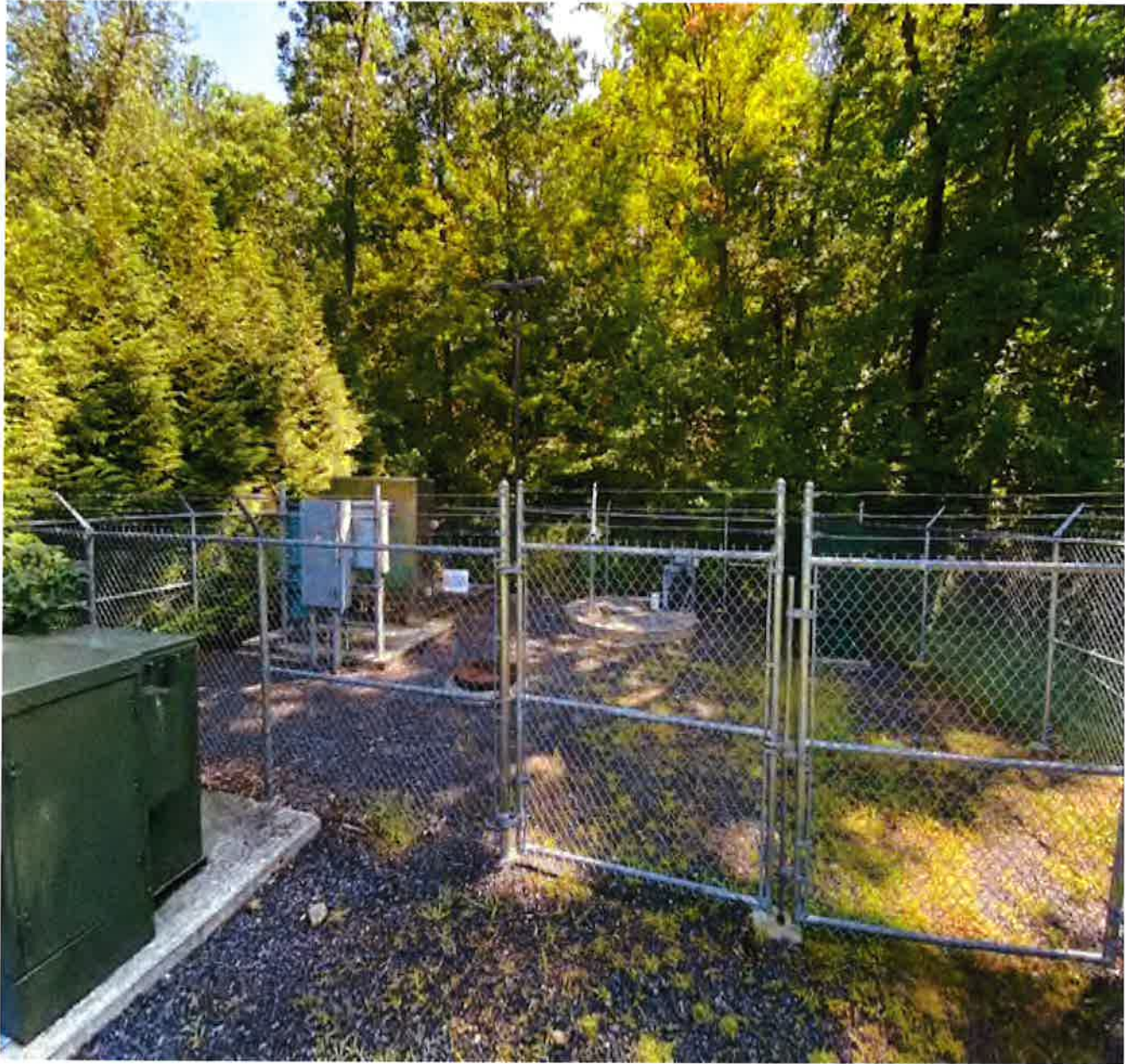
Regal Oak Lift Station

PAWC – Upper Pottsgrove Township Site Visit – July 22, 2020 Engineer - Chris Pelka (LTL Consultants)