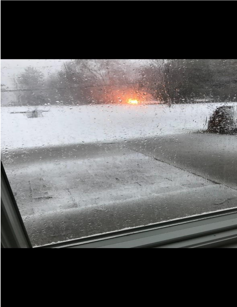
Exhibit 3 Electrical Fire in Backyard