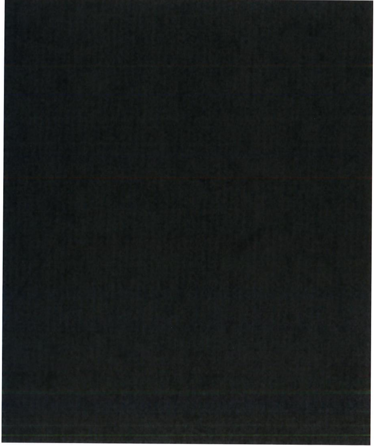
Exhibit B-1 - Confidential Security Information

Location/Unit Description Year $/Year $/Location $/Plant