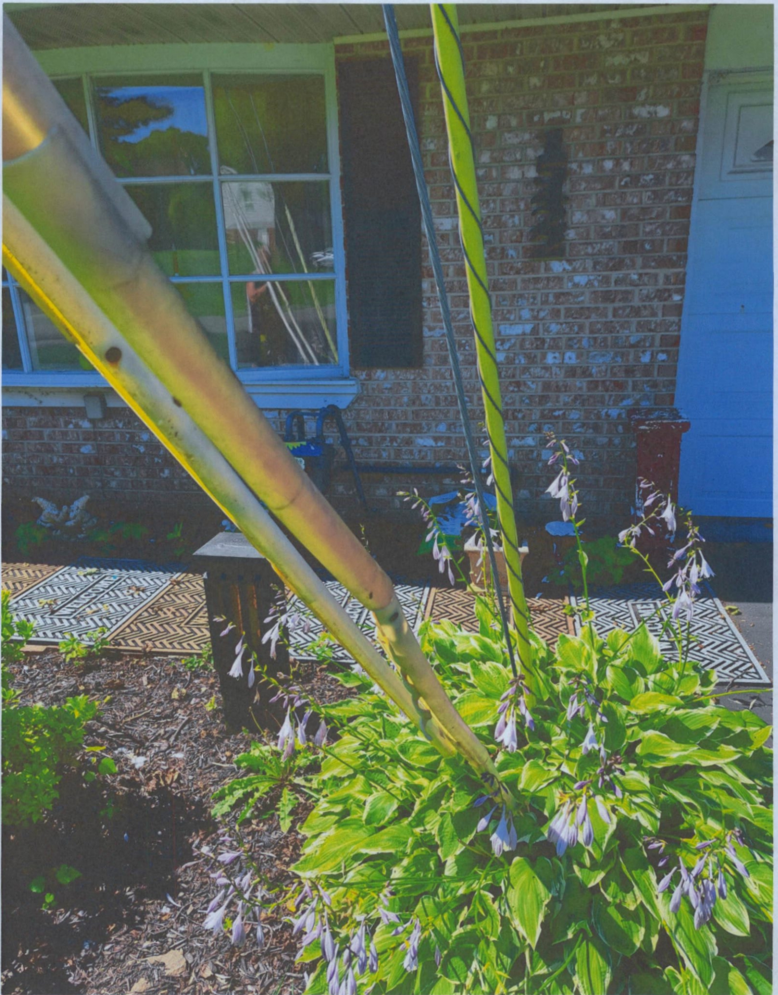
TOM Med Win 9-29-22