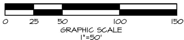
EXHIBIT A EAST PENN RAILWAYS INC FORCE MAIN CROSSING AGREEMENT WITH AQUA PA 441 FEET TO MP 35 NEW GARDEN TOWNSHIP CHESTER COUNTY, PENNSYLVANIA 05-28-2021