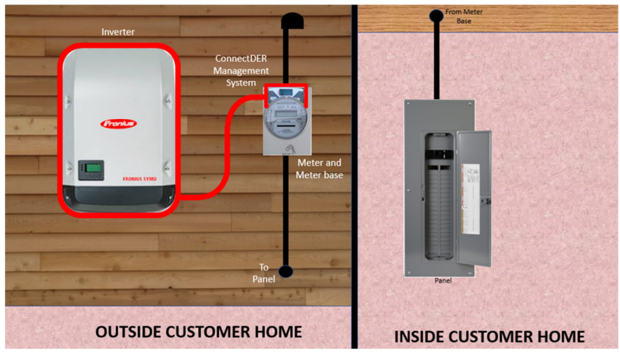
Figure 3: PPL Electric's DER Management Solution of Inverter-Based DER Systems

The following diagram is provided to illustrate how the inverter can be electrically wired to the ConnectDER Management device. Items highlighted in red represent the standard wire path and equipment installed. The diagram shows what the electrical connection would look like for a system less than 15 KW.