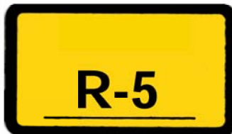
Exhibit R-5 page 1 of 6