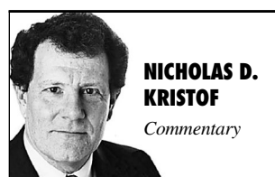
NICHOLAS D. KRISTOF Commentary

“I sort of perceive the documentary as this ‘get out of death’ card,” she told me in flawless, lightly accented