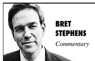
BRET STEPHENS Commentary

These are preposterous suggestions. That’s the point. Those who now argue that President Volodymyr Zelenskyy of Ukraine needs to be “realistic” or “pragmatic” — that is, that he should stop