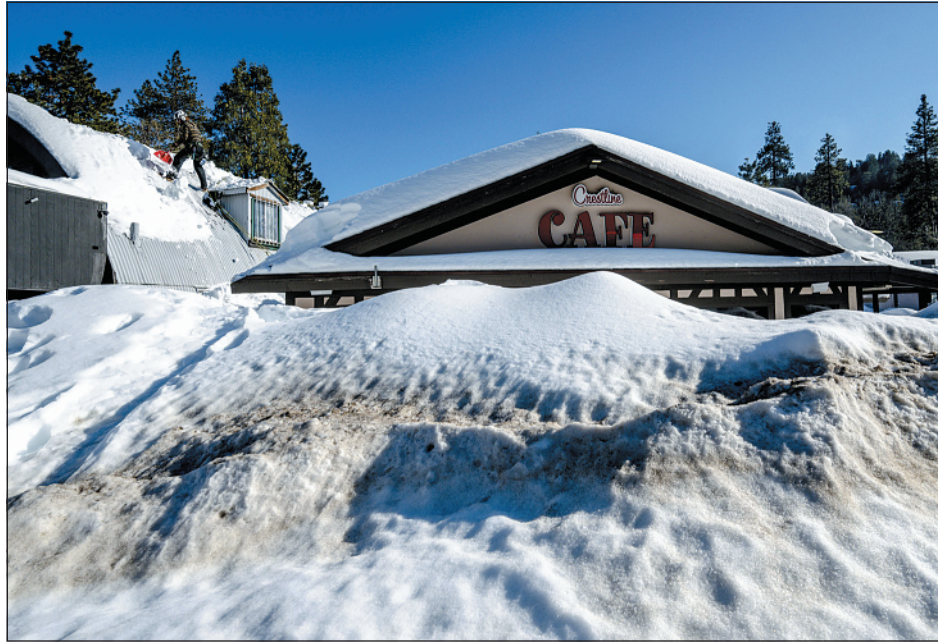
A man shovels snow off the roof of a store in Crestline on Friday as buildings remain buried in several feet of snow from recent winter storms.

In the San Bernardino Mountains, sheriff's authorities on Friday rescued a pair of 17-year-olds who