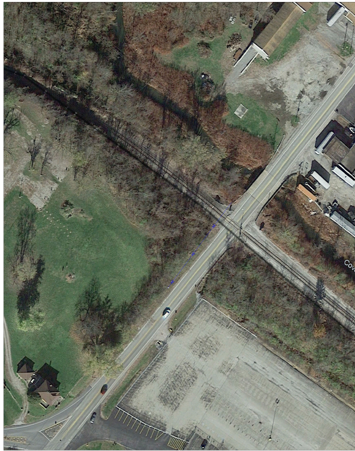
2 AERIAL MAP SCALE: NTS