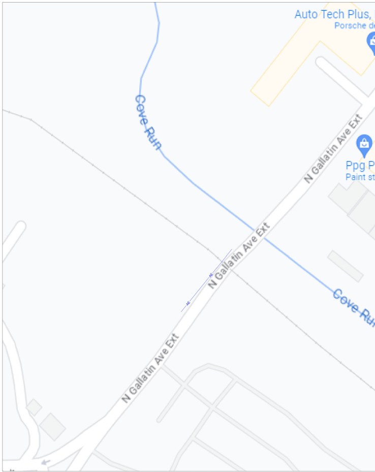
1 VICINITY MAP SCALE: NTS