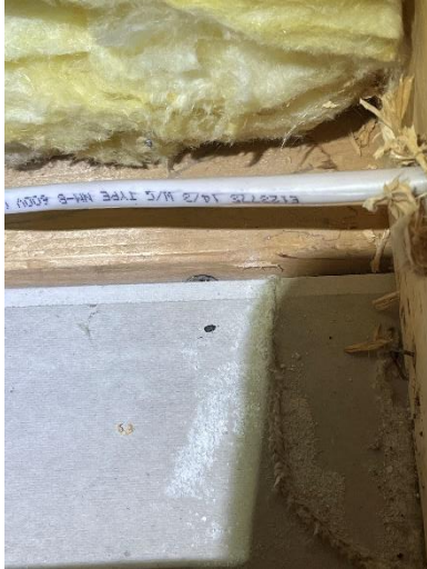
Unsealed top plate in attic