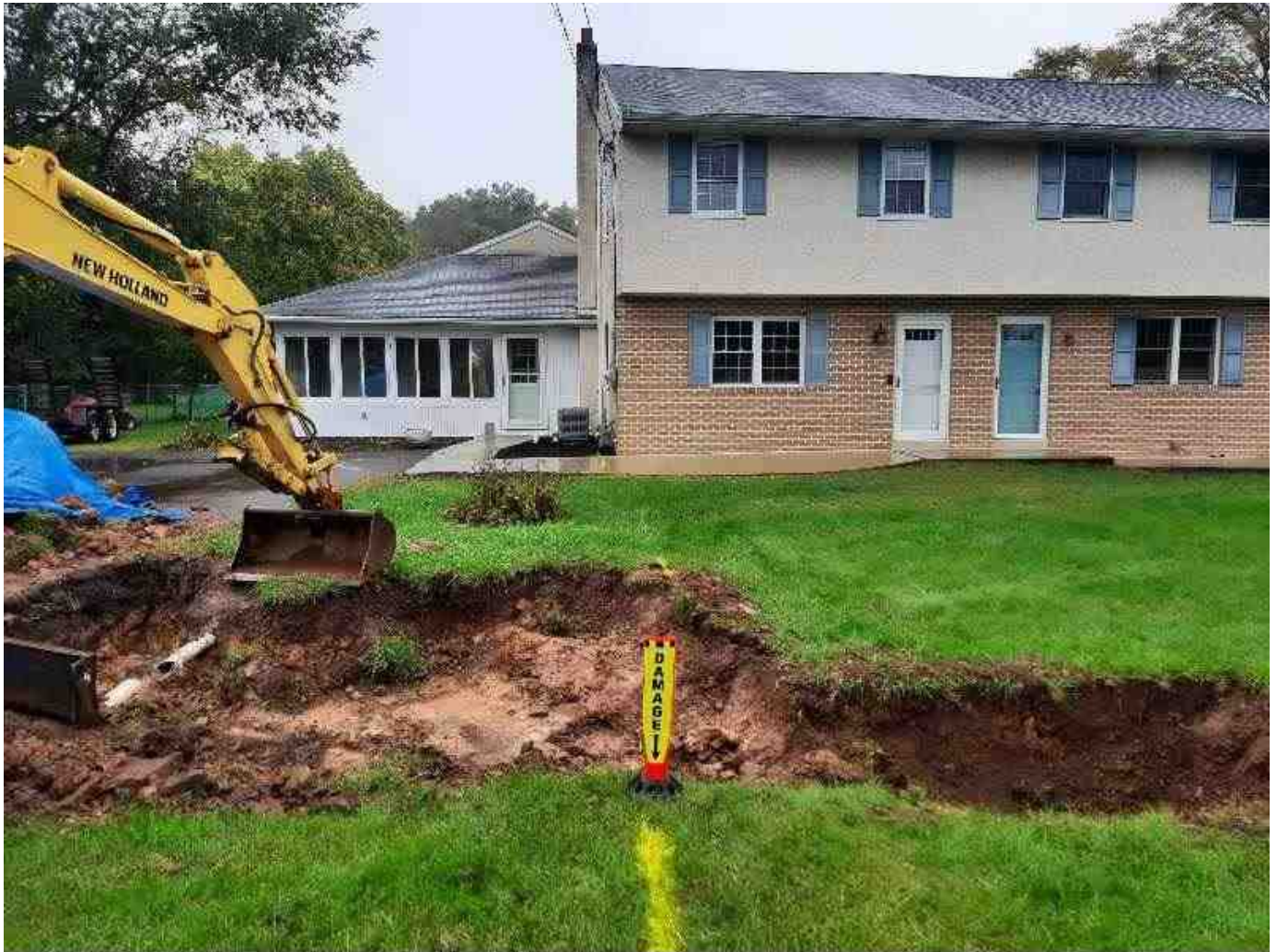
Photo created on 10/13/2022 12:37:53 PM EDT