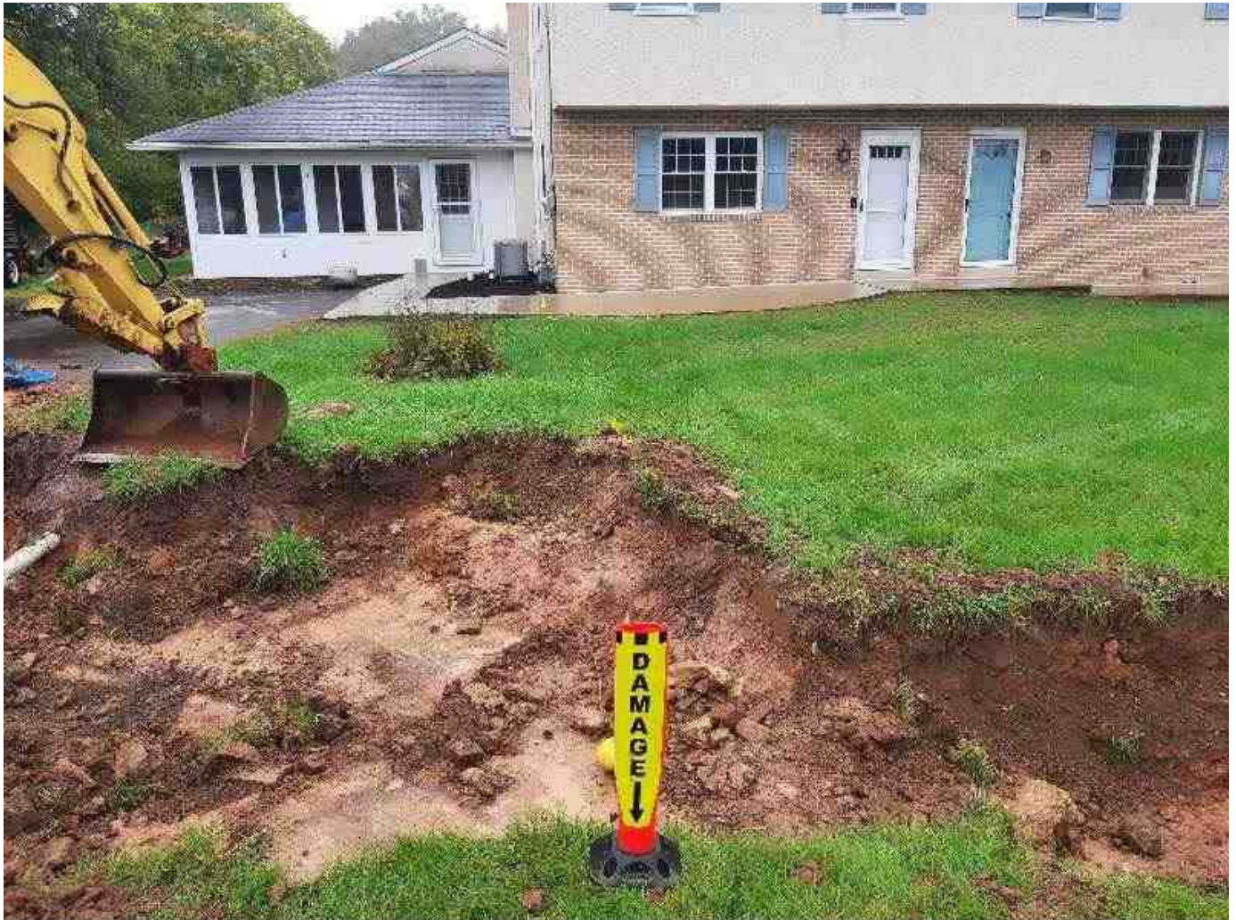
Property of United States Infrastructure Corporation Photo created on 10/13/2022 12:38:00 PM EDT