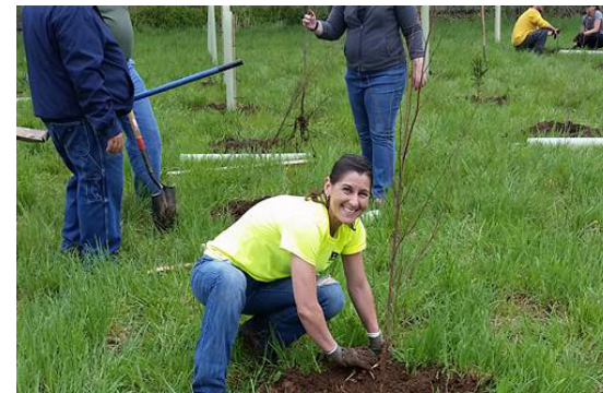
ENGAGED IN THE COMMUNITY