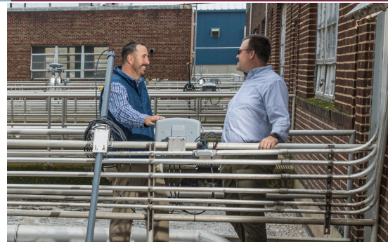
COLLABORATIVE & RESPONSIVE

We also think about the people who create the work: our employee-owners. We give them the freedom and flexibility to pursue their passions in and outside the office.