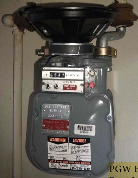
PGW Exhibit 5 Page 2 of 2