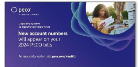
Above and below - November bill insert. Subsequent versions will have QR codes.