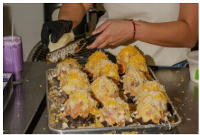
Inside Philly's Hottest New Dining Trend: Asian Breakfast