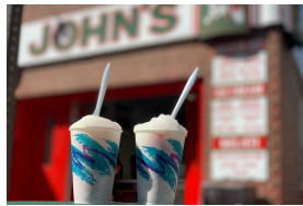
Where to Get Water Ice in Philly