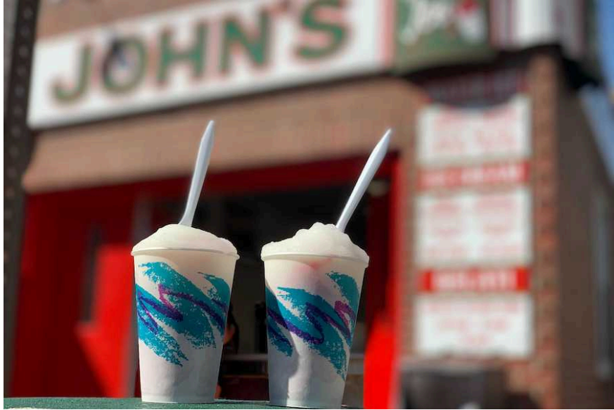
Water ice from John's