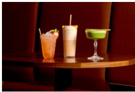
Best of Philly Spotlight: 11 Bars for Your Next Night Out