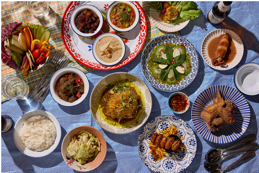
Dishes that will be served at the upcoming Kalaya and Fish Cheeks collaboration dinner.

If you're out and about today, you might notice a familiar name returning to the scene. Tequilas — which we lost in 2023 to a fire that had the place dark for two years — reopened in its old home at 1602 Locust Street in Center City last night .