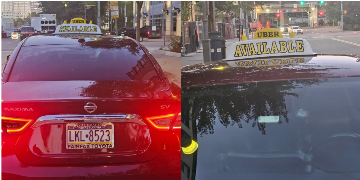
Exhibit B – Uber Work History Records