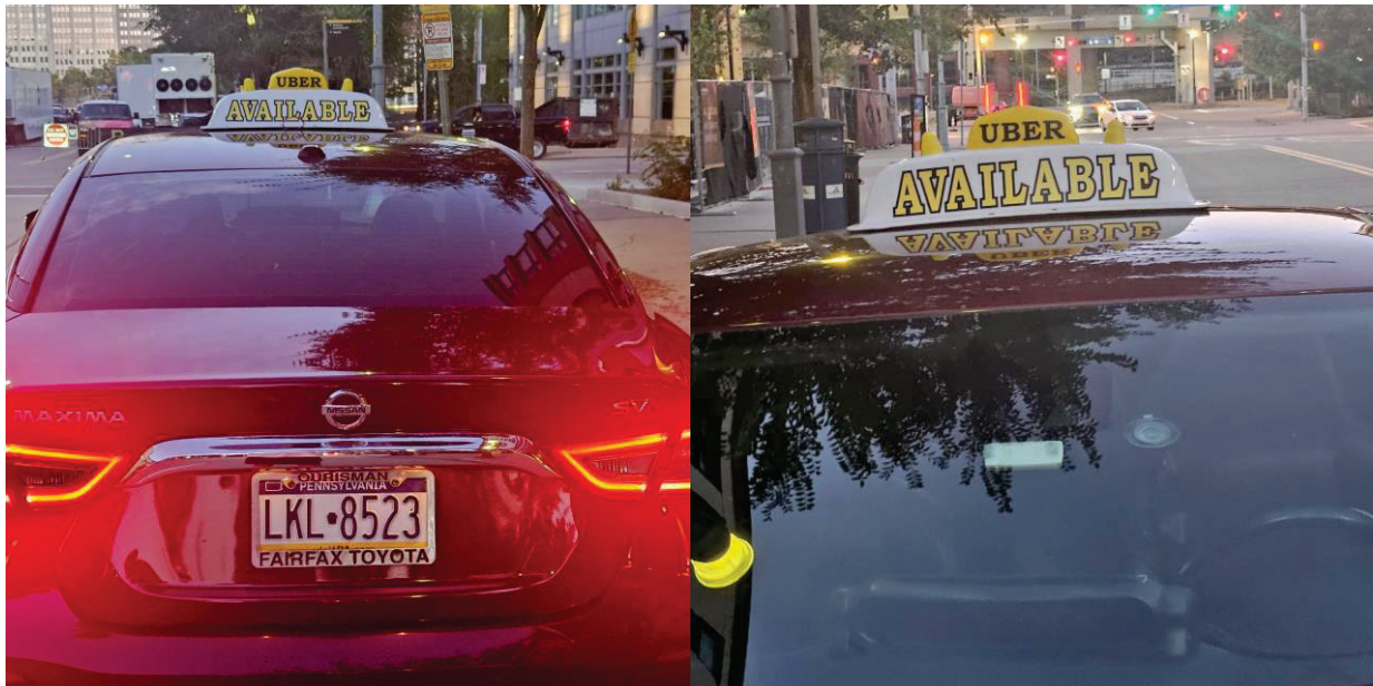
Exhibit B – Uber Work History Records