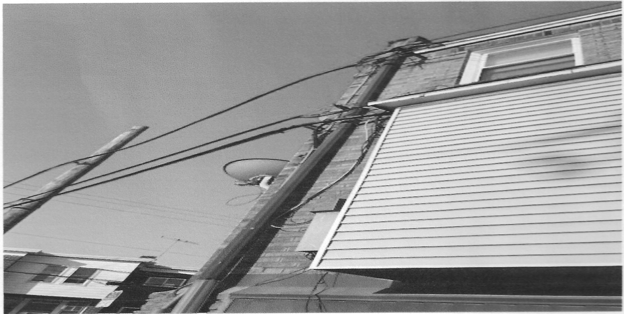
Photo #7 - Taken 05/27/2026 - Exterior View — Aerial Line From Pole Across Street is connected to PECO Bracket located on Claimant’s rear wall. Description: This photo shows the PECO aerial service line extending from the pole located across the street at E. Loudon & Bingham directly attached to the Claimant’s rear wall. The angle and tautness of the line demonstrate the direction of tension applied to the structure. This image visually confirms the load path described in PECO Work Order 19203009 (“job to put additional pole... to reduce load on rear bracket”).